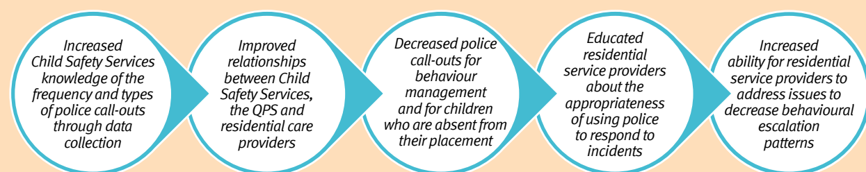
Figure 2: Outcomes of Project EURECA

This local initiative achieved a number of benefits for children and residential care services operating in the area: