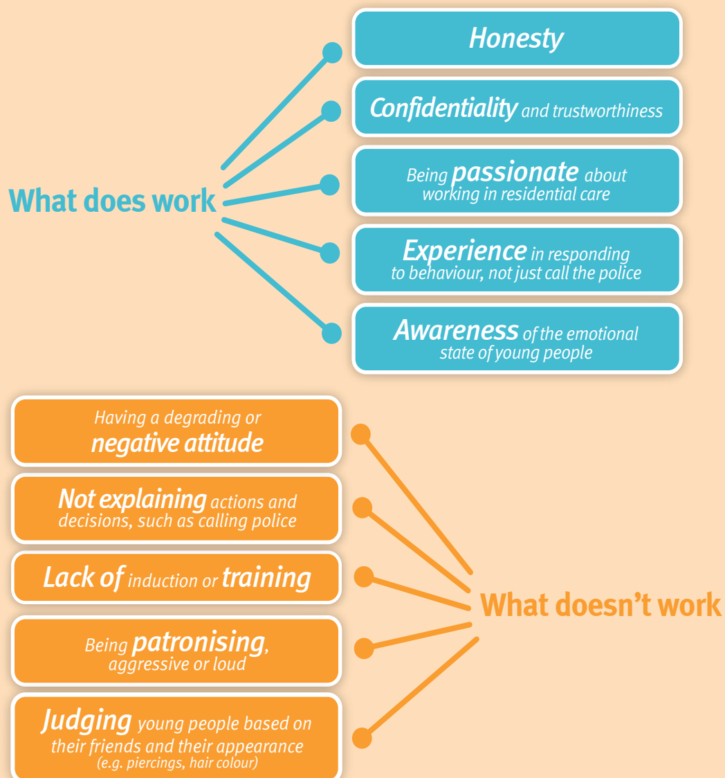
Figure 1: Children’s perspectives on qualities that make a good and a not-so-good residential care worker

The below diagram illustrates children’s perspectives on qualities that make a good and a not-so-good residential care worker.